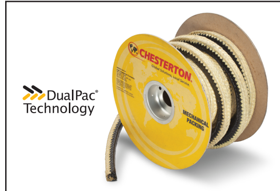
Figure 1: Chesterton DualPac Technology results in a braided packing with distinct benefits on each side.