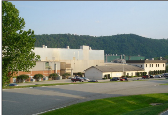
Paper mill was challenged with unreliable sealing with the agitator.

Increase time of continuous service to support plant cycle and reduce costs.